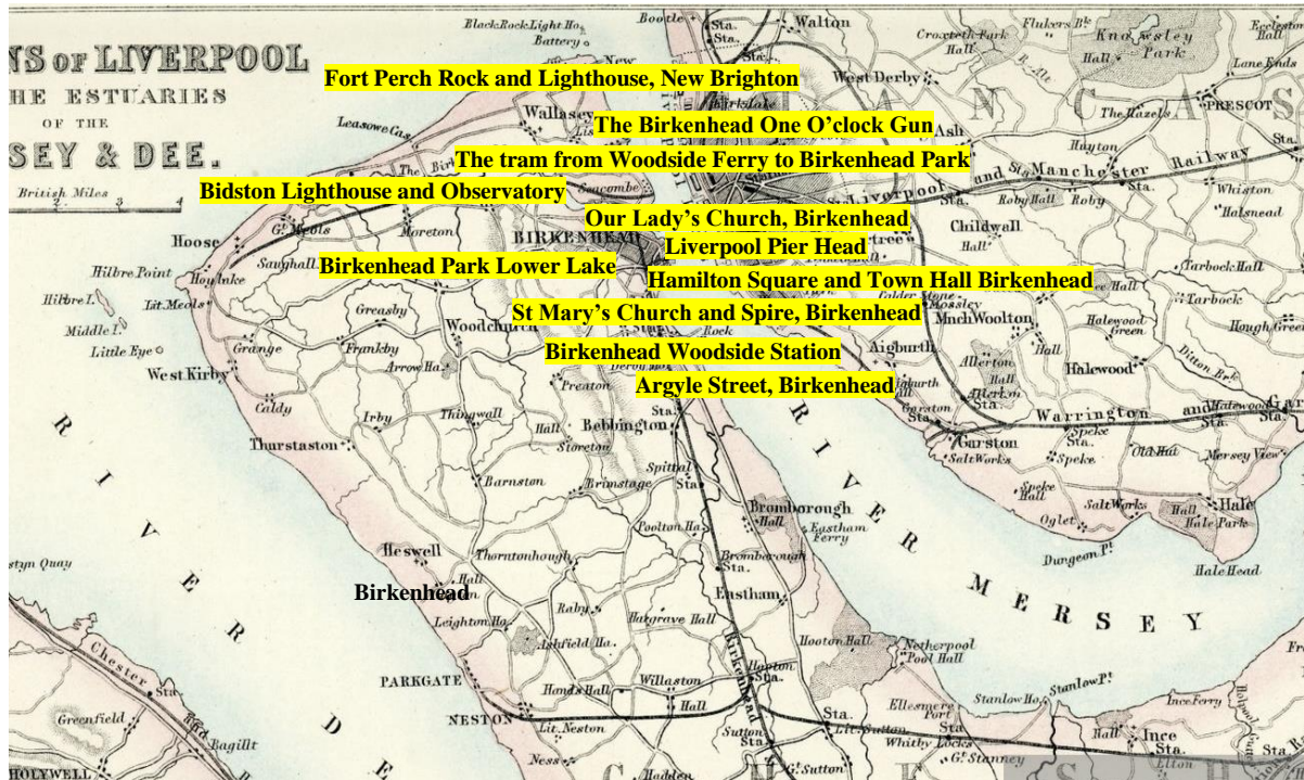
The Wirral Peninsula in c1860

It will be the local historians and ordinary people of Merseyside who will confirm that Jules Verne's Floating Island is indeed Birkenhead and Wallasey 'in disguise'.